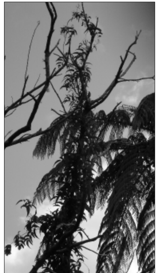
Death by strangulation: this dead tree still wears its mantle of jasmine.

If you still have Ginger plants and/or Agapanthus on your property, now is the time to remove the seed heads.