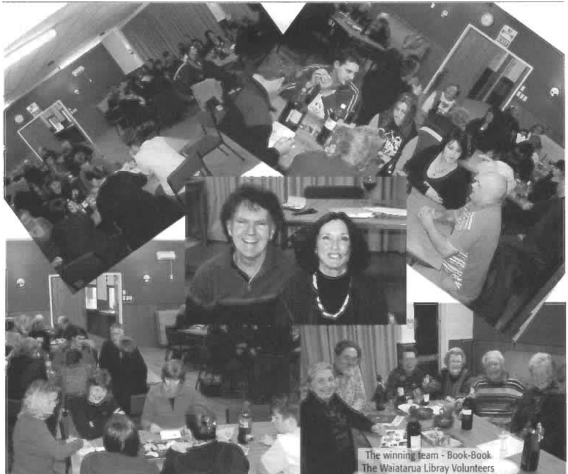
The winning team - Book-Book The Waiatarua Library Volunteers