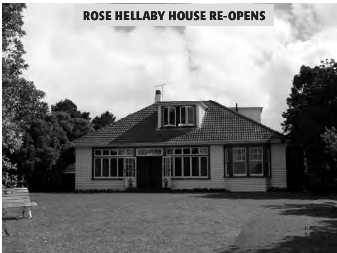
ROSE HELLABY HOUSE RE-OPENS

YOGA - FAY'S CLASS: for true fitness and relaxation Ph 837-7794