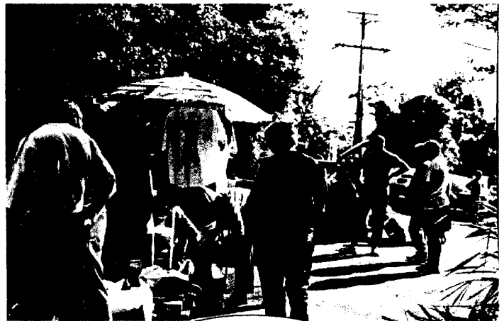
Waiatarua Car Boot Sale 1999